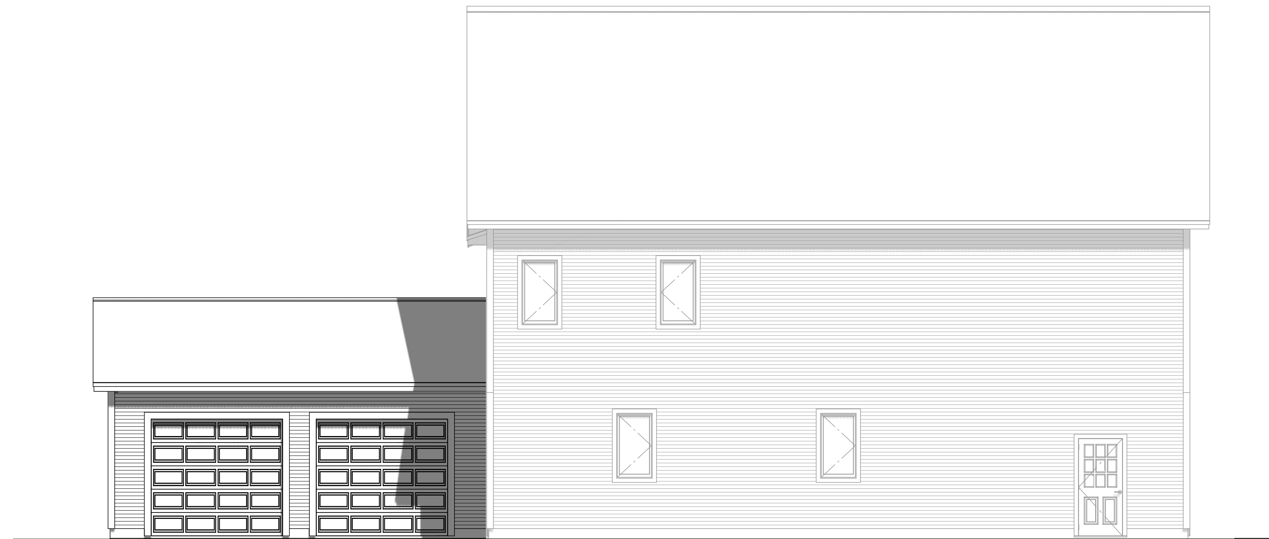
WEST ELEVATION PROPOSED GARAGE SCALE: 1/4"=1'