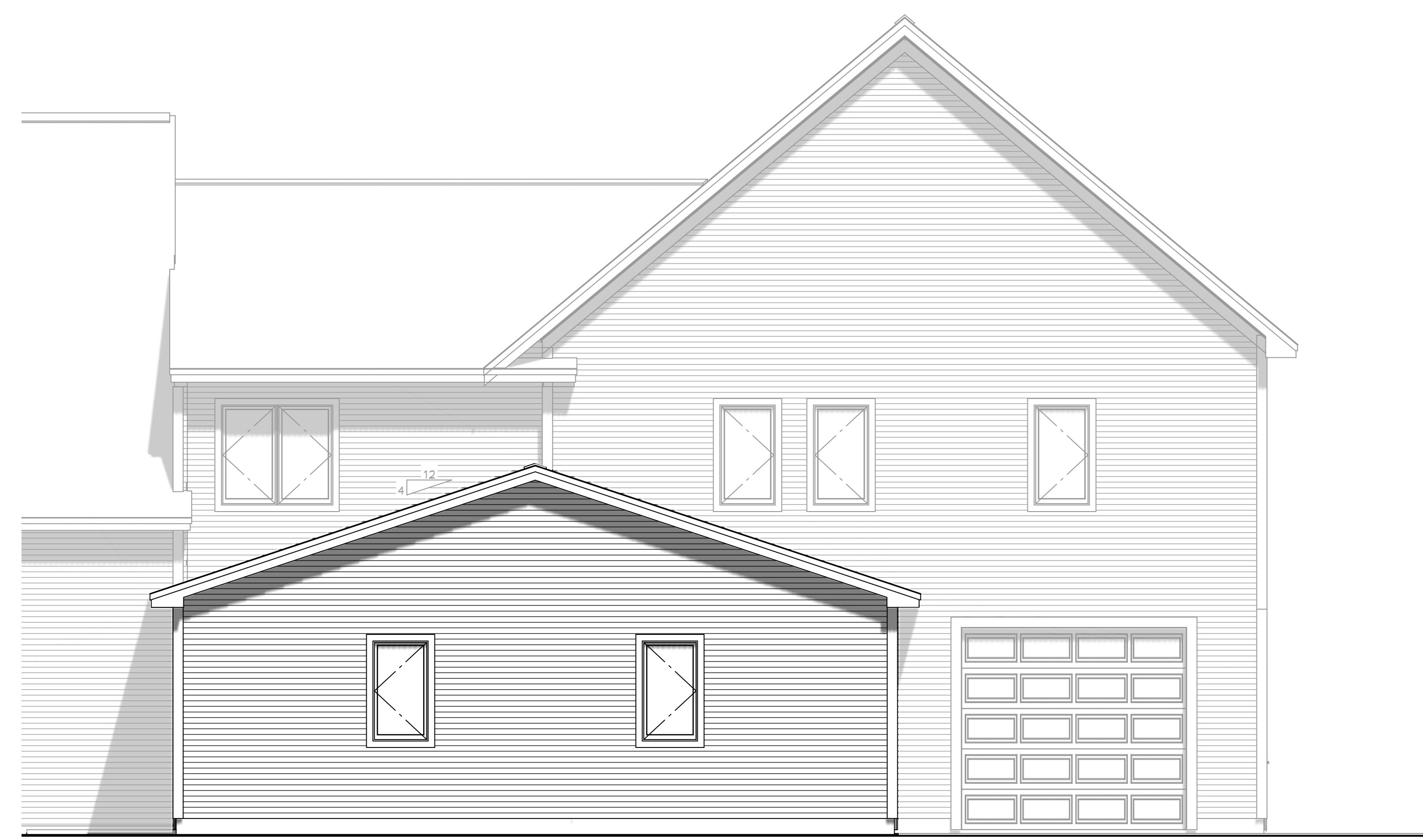
NORTH ELEVATION PROPOSED GARAGE SCALE: 1/4"=1'