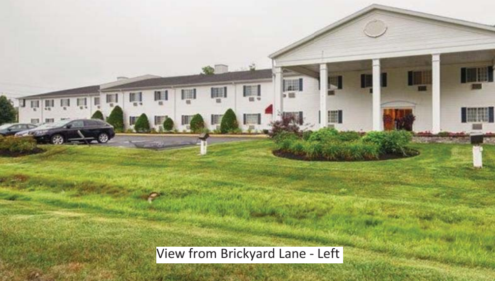
View from Brickyard Lane - Left