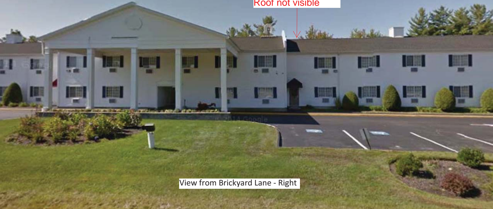
View from Brickyard Lane - Right